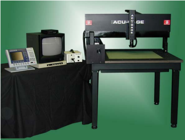
Left: A 24" x 24" (600mm x 600mm) Manual Inspection System